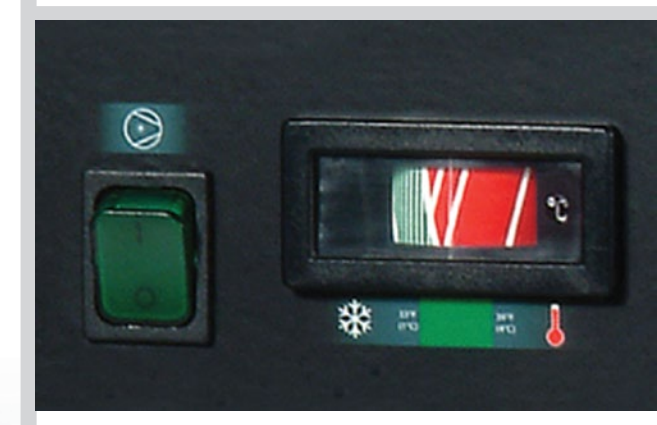
Controls: Models 75 - 150 scfm

Adjustable Timed Electric Drain for HGEN Models 75 - 150 scfm